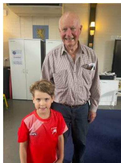
Photo: attendees were aged 5 years and 88 years.

The May Parish Lunch proved very popular, with 80 people of all ages attending and representing all three Sunday congregations. Many new people joined us too. We had fun discussing the decades we were born in (1930s to 2020s!) and getting to know each other over a delicious meal, all helping to deepen our sense of St Mark's community and connection. Next lunch is on 30 August.